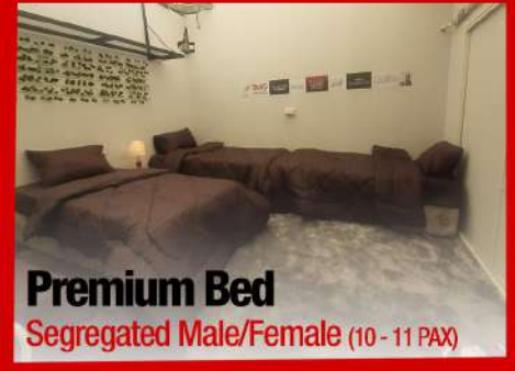
Premium Bed Segregated Male/Female (10 - 11 PAX)