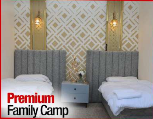
Premium Family Camp