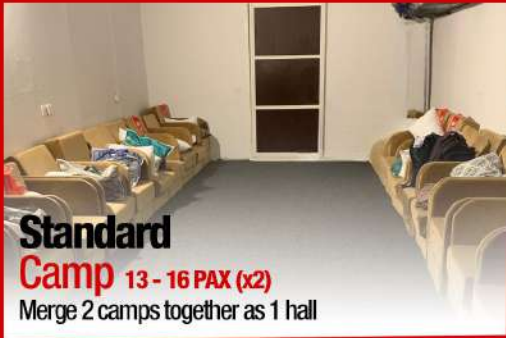
Standard Camp 13 - 16 PAX (x2) Merge 2 camps together as 1 hall