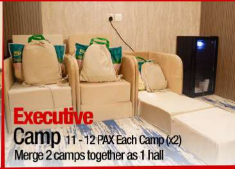
Executive Camp 11 - 12 PAX Each Camp (x2) Merge 2 camps together as 1 hall