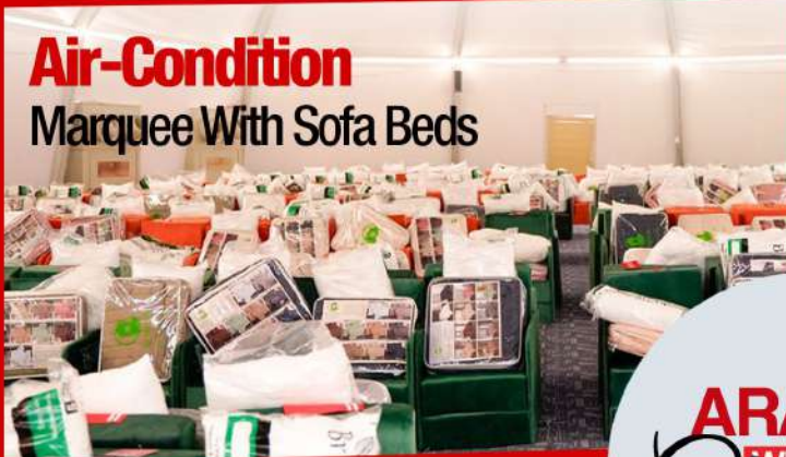
Air-Condition Marquee With Sofa Beds